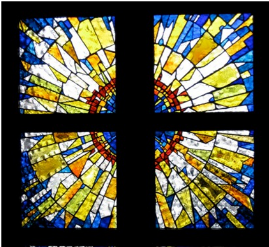
St. Paul's Anglican Cathedral, Melbourne, Australia