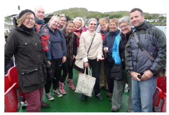
Photo taken on a ferry in Scotland from Iona to the Isle of Mull with part of my study group