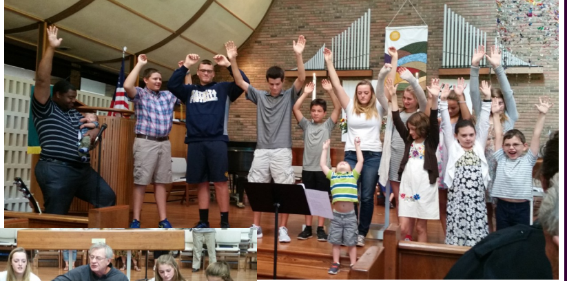
Pictures from our worship service on Sunday, September 11, 2016 (that was led by the youth that participated in the Presbyterian Youth Triennium).