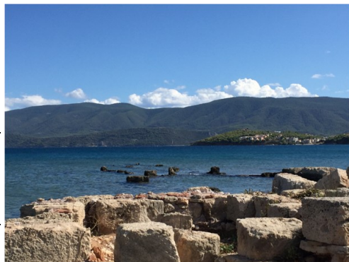
The seaport where Paul sailed from Greece, outside the city of Corinth