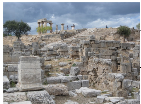
Ancient city of Corinth