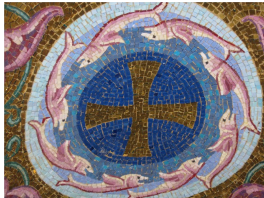
Mosaic on the ceiling of the church outside Philippi honoring Lydia, the first person Paul baptized on European soil.

I traveled with twenty one people, mainly Anglican Christians from Manchester, England.