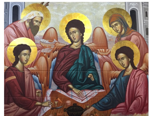
Visiting an iconographer's workshop; icons in the Orthodox Church are sacred painting. This icon represents the Trinity.