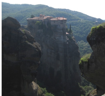
To left: one of the amazing Meteora Monasteries that cling to rocks that rise from a valley floor.