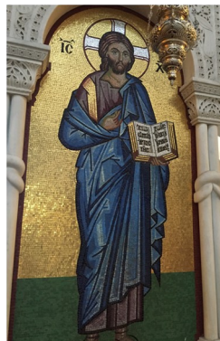
Mosaic of Jesus inside the Agios Dimitrios Church in Thessalonica