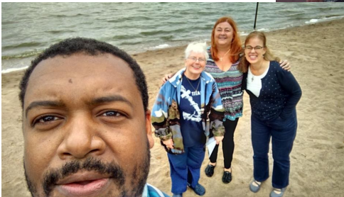
A few photos from the Scavenger Hunt on Sunday, October 16th. See all the pictures from the event on our FB page!