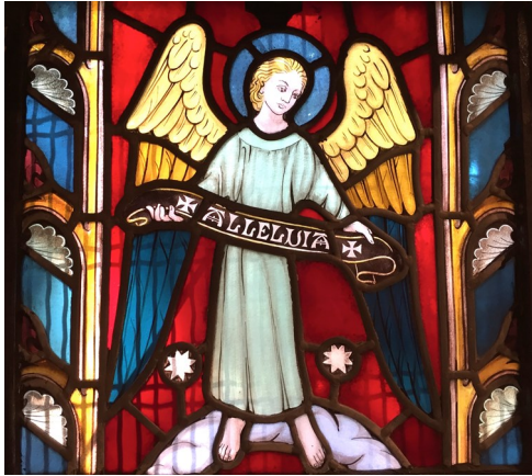
Stained glass window at St. Paul's Church of Withington, Manchester, England