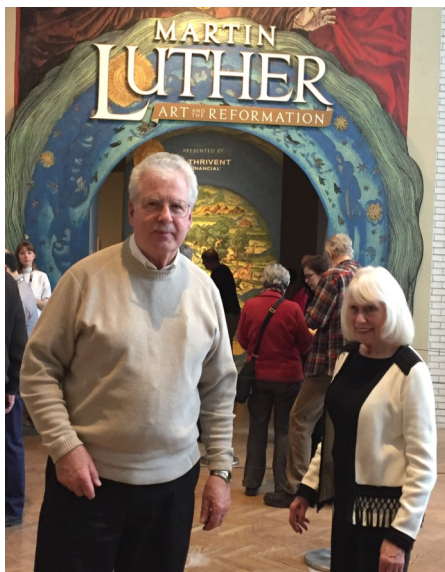
Pictures from the Martin Luther exhibit at the Minneapolis Institute of Art. A group from Calvin went on Monday, January 9th.