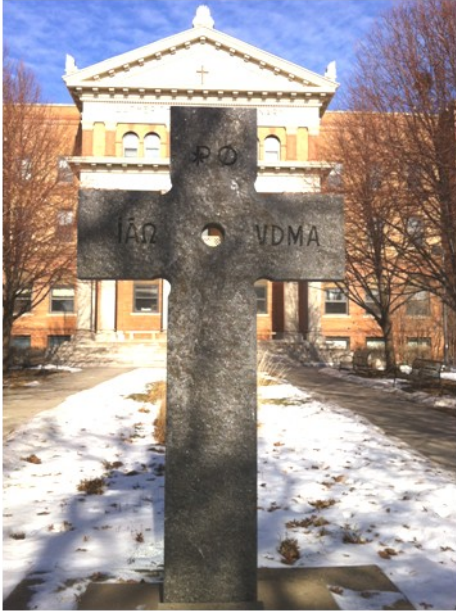
Cross in front of Luther Seminary in St. Paul. It is a replica of a Celtic cross from about 1000AD, believed to be the first Christian symbol erected in Norway.