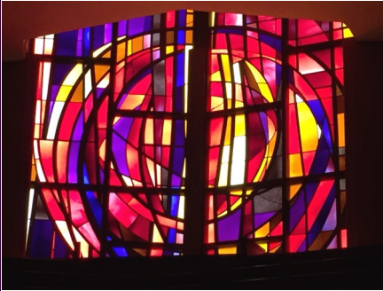
Window at St. Olaf Catholic Church, Minneapolis