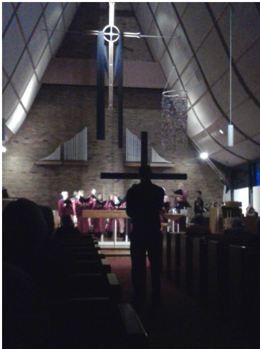
Picture of the sanctuary during our Good Friday worship service on Friday, March 30th.