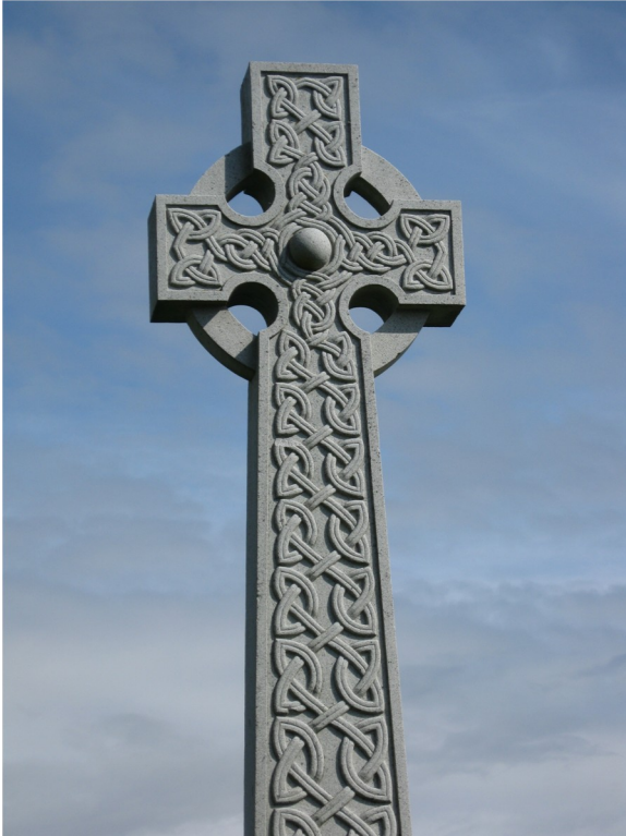
Cross on the isle of Iona, Western Hebrides, Scotland