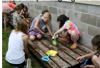
VBS crew planting vegetables