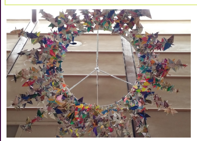
Flock of 1000 origami peace cranes suspended in our sanctuary. Notice the peace sign within the circle?

We would love to have good representation from Calvin at the Gathering. We want to show off our beautiful church and extend our hospitality to the other women of the Presbytery.