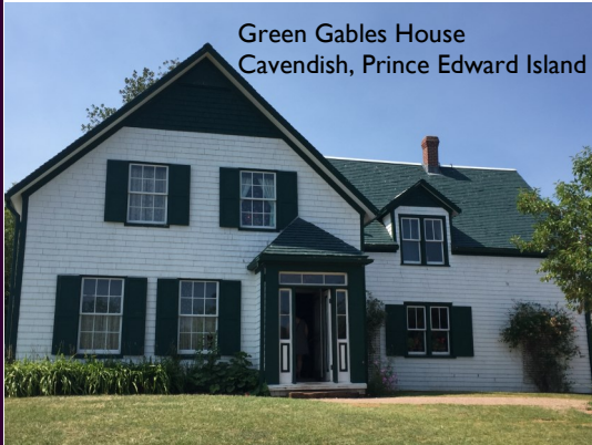
Green Gables House Cavendish, Prince Edward Island