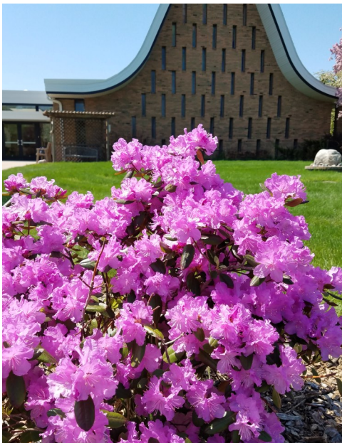
Azaleas in bloom in Calvin's labyrinth garden - May 2018