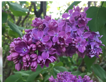
Photos from the Landscape Arboretum, including one of their summer origami sculptures