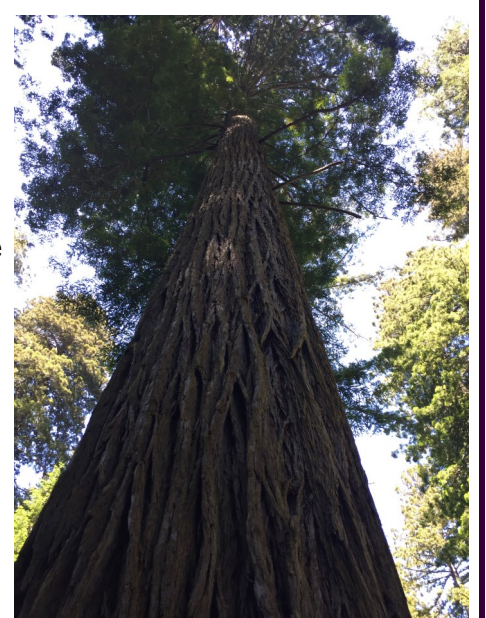
Looking up at a giant redwood tree in Redwood National Park in California