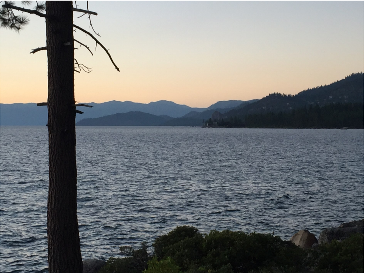
Zephyr Point, Lake Tahoe, Nevada