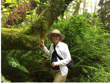
Hiking the Fern Canyon in Prairie Creek Redwood State Park, California