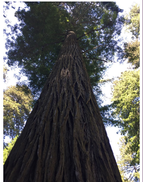
Looking up at a giant redwood tree in Redwood National Park in California