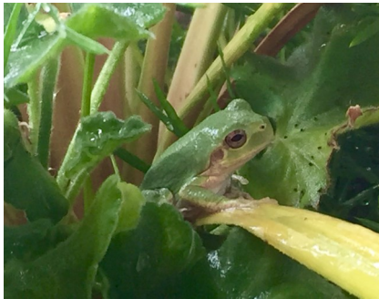
A little, green visitor to our flower planter outside the front door.