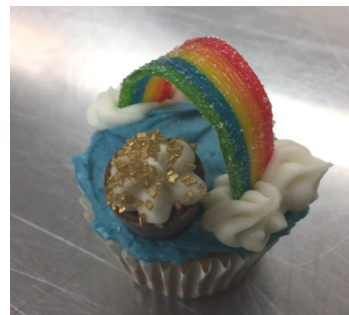
A surprise treat at one of the Lenten soup suppers in March

Easter flowers - We will have a variety of flowering plants in the chancel on Easter Sunday. To order flowers please fill out an order form and return it with payment to the church office no later than Wednesday, April 10th. Order forms are available in the Gathering Hall.