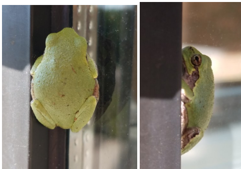
A little, green visitor to our front door this past August. He hung out on the door all day!