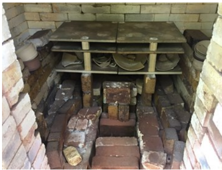
Looking inside another kiln

Seeing the wheels and the kilns the potters use, I mentioned to my brother a passage from the Biblical prophet Jeremiah. It was never an easy job to be a prophet, and the book of Jeremiah tells how the prophet struggled to get the attention of people who had turned away from God. It was a difficult time in the nation's history after a foreign army had invaded Jerusalem and carried people off into exile in Babylon. Jeremiah speaks of a potter reworking clay to make a misshapen vessel into a useful one.