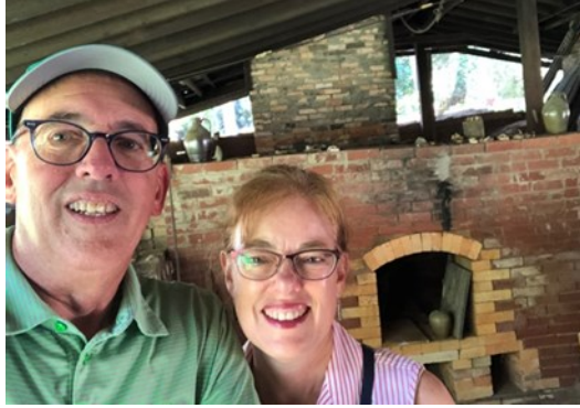
With my brother at one artist's studio; the potter's kiln in the background