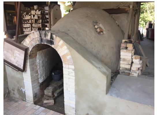
Kiln at yet another potter's studio

For surely I know the plans I have for you, says the Lord, plans for your welfare and not for harm, to give you a future with hope.