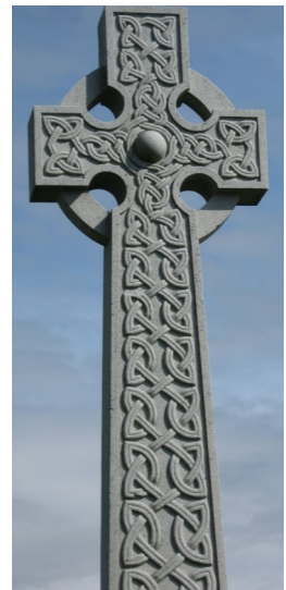
Cross from Isle of Iona, Scotland

No, in all these things we are more than conquerors through him who loved us. For I am convinced that neither death, nor life, nor angels, nor rulers, nor things present, nor things to come, nor powers, nor height, nor depth, nor anything else in all creation, will be able to separate us from the love of God in Christ Jesus our Lord.