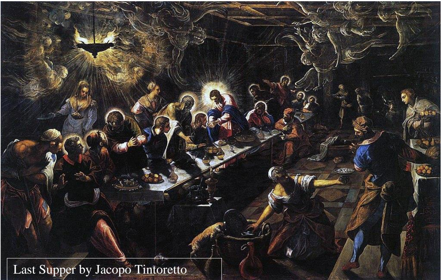
Last Supper by Jacopo Tintoretto