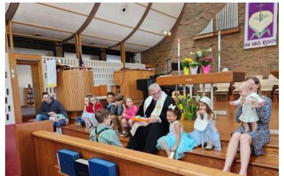
Children's message on Easter Sunday

Children's Choir is starting back up! They will meet at 10:50 am and kids will be upstairs around 11:05 am and be performing on Mother's Day!