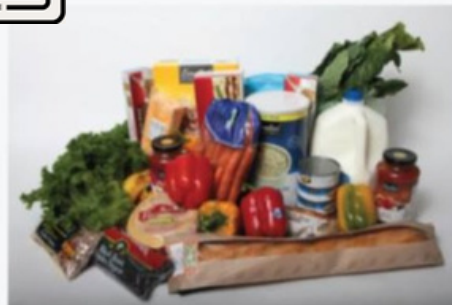
Your food shelf's $10